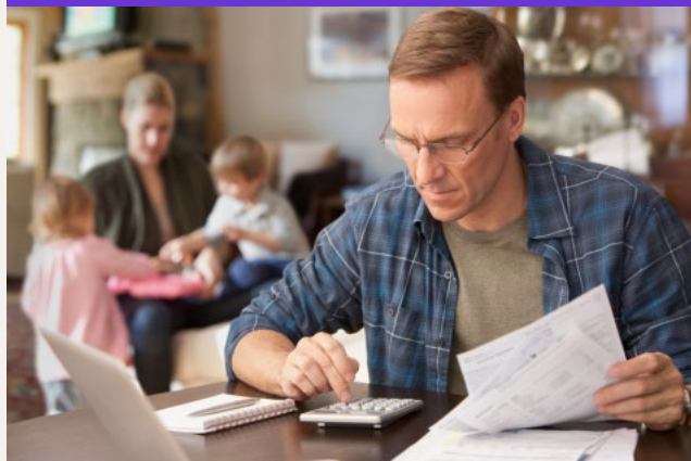
Active vs passive money behaviour