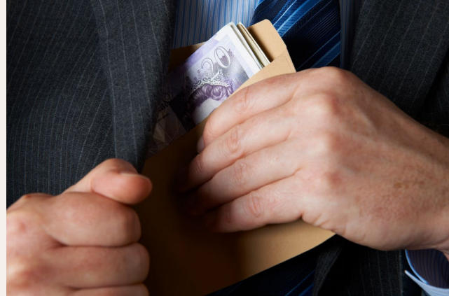
Women pop pounds and pennies into piggy banks while men stash wads of cash in jacket pockets